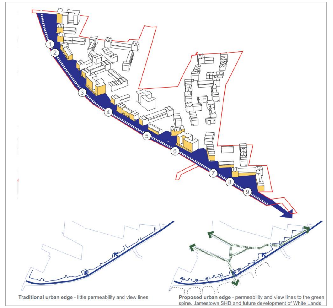
Figure 2-2: RORR Interface & Urban Edge

Additionally, the Board also requested that "further consideration/justification should address the open space strategy, inter alia the need passive surveillance and functionality of open space". With regard to the open space strategy the proposed design has positively addressed the management of these open spaces. A taking in charge map has been prepared by RKD with outlines the future management and maintenance of all public open space areas.